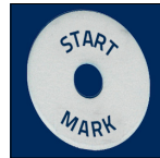
Close-up of the start/mark switch