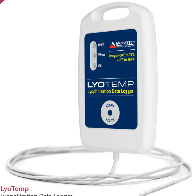
LyoTemp Lyophilization Data Logger

See MadgeTech's terms and conditions at www.madgetech.com